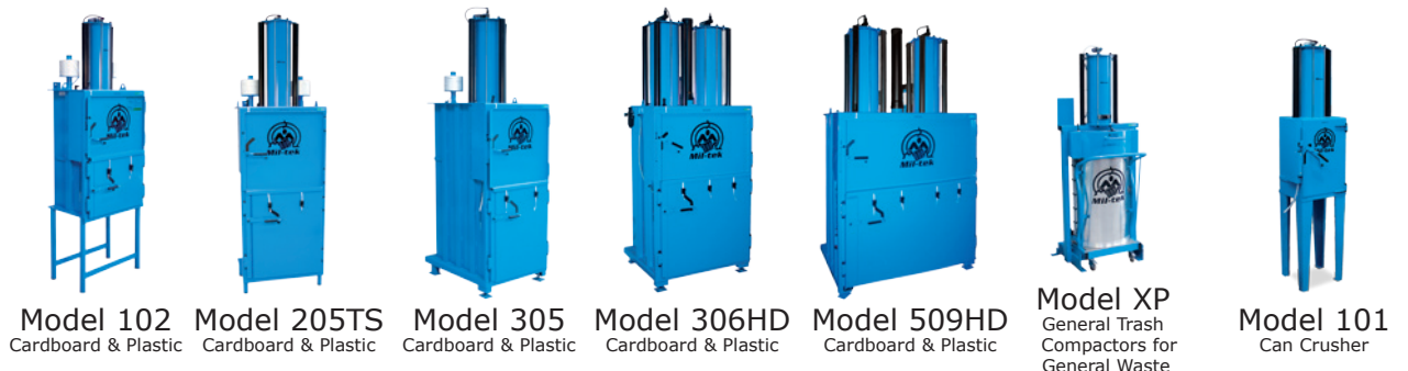
Model 102 Cardboard & Plastic Model 205TS Cardboard & Plastic Model 305 Cardboard & Plastic Model 306HD Cardboard & Plastic Model 509HD Cardboard & Plastic Model XP General Trash Compactors for General Waste Model 101 Can Crusher